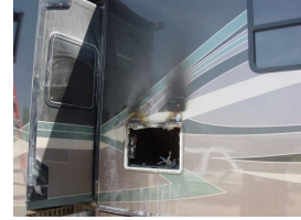
This fire caused $100,000 of damage to a $600,000 coach